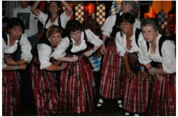
Our lovely dancers show how they "Pump You Up" during our performance at the 2006 Winston-Salem Oktoberfest.